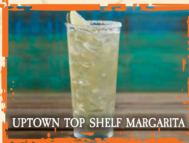
UPTOWN TOP SHELF MARGARITA

*2,000 calories a day is used for general nutrition advice, but calorie needs vary. Additional nutrition information available upon request.