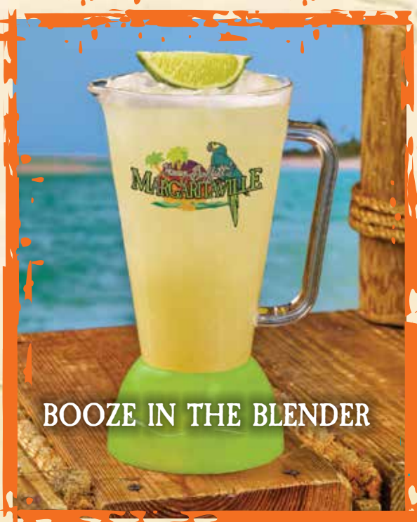
BOOZE IN THE BLENDER

Margaritaville Gold Tequila, triple sec and your choice of all-natural fruit purée: strawberry, raspberry or mango. Served frozen (380-400 calories) $7.75